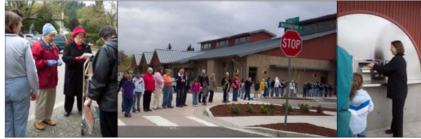
Book Brigade: April 16, 2007

Internet use jumped 64% over 2006, totaling 17,731 logins. Our new internet lab seats 12.