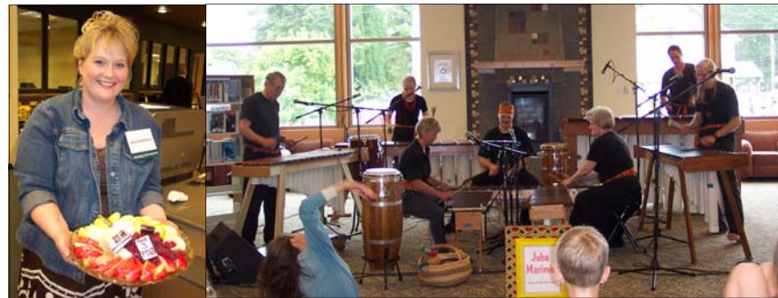
Preview party: May 12, 2007